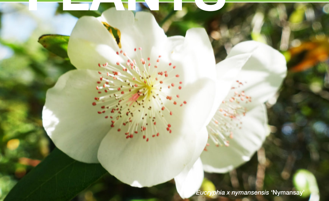
Eucryphia x nymansensis 'Nymansay'