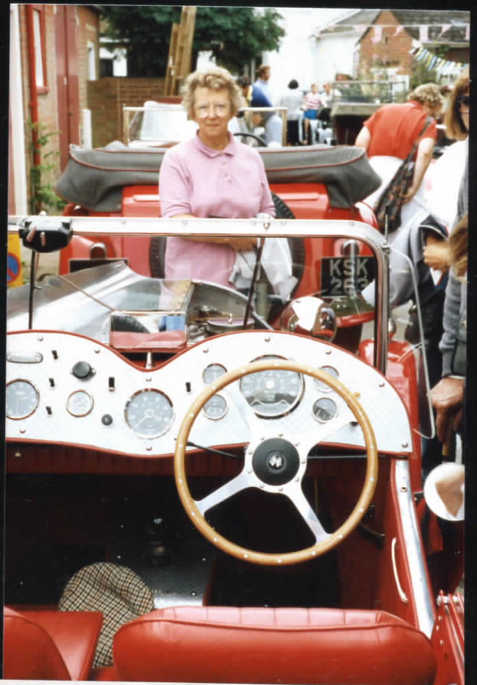
In George Yard there was a display of ten cars from the 1920s to 1960, arranged by the Allsorts Motor Club.